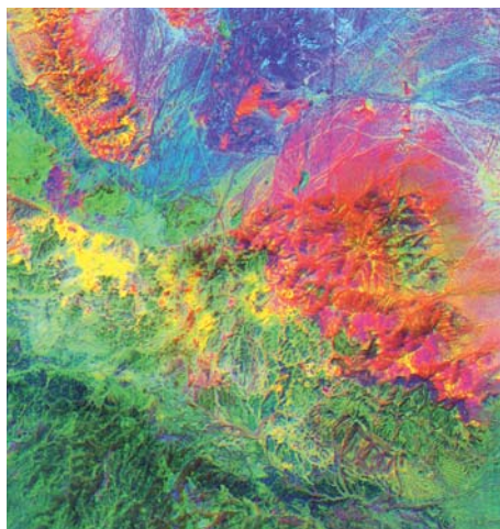
ASTER vnir-swir decorrelation stretch 4(R), 3 (G), 7(B) Saturation stretch.